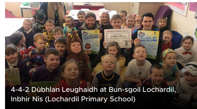
4-4-2 Dùbhlán Leughaidh at Bun-sgoil Lochardil, Inbhir Nis (Lochardil Primary School)

In 2019-20 we were delighted to secure a grant from Bòrd na Gàidhlig to enable the challenge to be accessible in Gàidhlig.